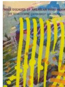
Three Decades Exhibition Catalog (DOC- 000003)