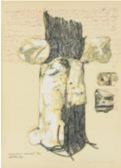
Akhmatova's Monument (ART-000051)