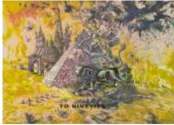
Welcome to the Nineties (ART-000657)